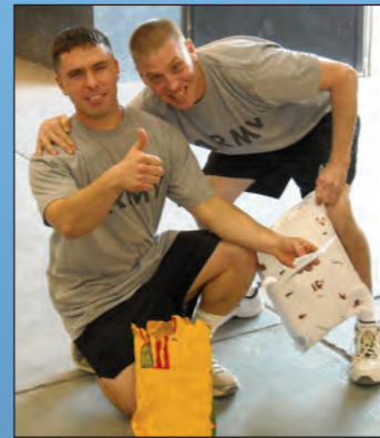
Pictured are just a couple of the many soldiers who received stockings in 2009

attorneys), along with a list of most requested items from Soldiers. The volunteers fill the stocking with gifts/items for the individual soldier and personalize the card. Many of the volunteers received personal responses from the soldier. The volunteers put the stockings in a separate envelope and return it to the Paul's for shipping. The law firm of BGS provides the funds for the postage on the shipment.